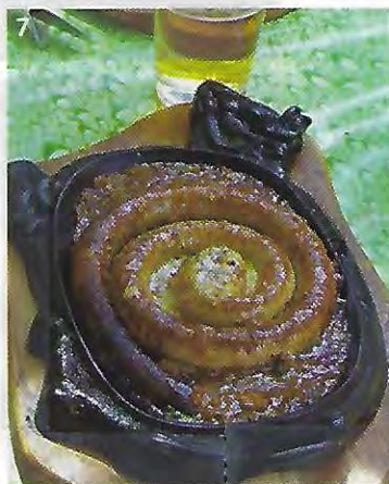
1) Classic Bavarian Weisswurst at the Weisses Bräuhaus restaurant and beer tavern in downtown Munich. 2) Butcher shop sign showing sausages simmering in a pot. 3) Broth-cooked sausages served in a pewter pot at the Goldene Posthorn restaurant in Nuremberg. 4) Regensburg's Historische Wurstküche claims to be "the oldest Bratwurststube in the world," dating from the mid-1100s. 5) A selection of sausages on the grill at the Goldene Posthorn restaurant in Nuremberg. 6) Pork sausages and sauerkraut at the historic Wurstküche in Regensburg. 7) A half-meter coiled Bratwurst (for "light" eaters) at Sulzfeld am Main (in Franconia), birthplace of the meter-long Bratwurst.