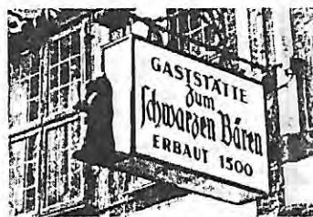
schwarzen Bären black bear erbaut built