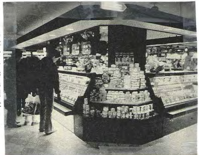
Das KaDeWe beherbergt das größte Schlemmerparadies

Department stores, concentrated in very few corporate hands, have little specifically German about them. Many have a food market in the basement or on the top floor; more and more of them offer space to boutique chains, so a store may contain a number of franchises. The Bloomingdales of Germany is probably Berlin's KaDeWe, which covers a whole city block. It is perhaps best known for its remarkable food floor, where the shopper can purchase all manner of exotic produce and then linger at one of the many gourmet counters and corners to sample luxury edibles and sip champagne. Increasingly, you'll find fancy delis and snack bars in other department stores, but for sheer quantity and quality, KaDeWe is unbeatable.