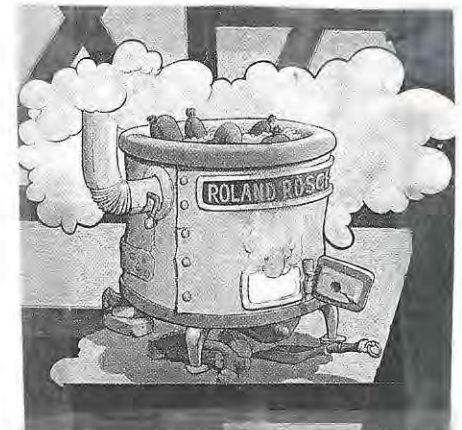
Butcher shop sign showing sausages simmering in a pot.

► BUTCHER SHOPS: Known as Metzgerei , these often have a corner that serves warm snacks. The Vinzenz-Murr chain in Munich and Bavaria has particularly good-value food. Try Warmer Leberkäs mit Kartoffelsalat , a typical Bavarian specialty, which is a sort of baked meat loaf with sweet mustard and potato salad. In north Germany, try Bouletten , small hamburgers, or Currywurst , sausages in a piquant curry sauce.