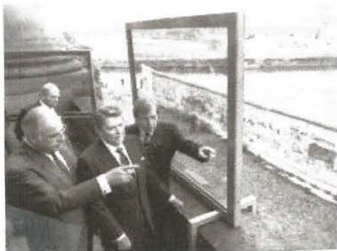
US president Ronald Reagan (C), German chancellor Helmut Kohl (L) and Berlin lord mayor Eberhard Diepgen (R) visit the Berlin Wall in West Berlin, Germany, 12 June 1987.