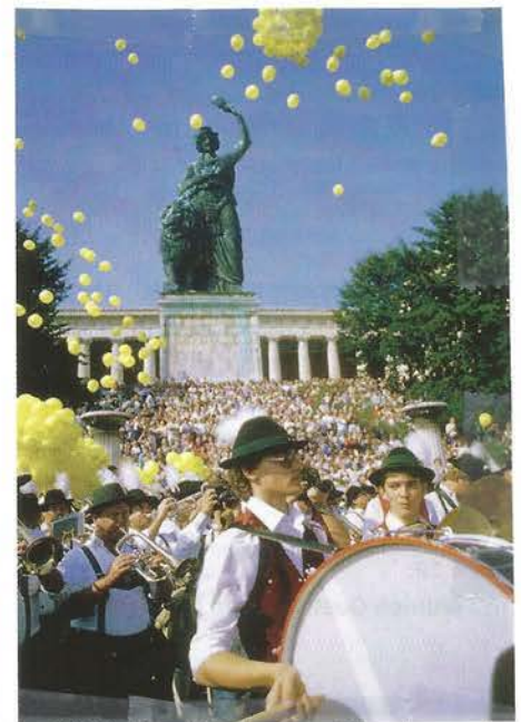
One of the Oktoberfest highlights will be the annual band concert at the Bavaria Statue, with as many as four hundred band members participating.