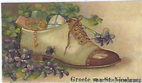
This postcard from the 19th century depicts the Dutch tradition of filling shoes with goodies for Sinterklaas

Don't forget to leave your boots on the doorstep!