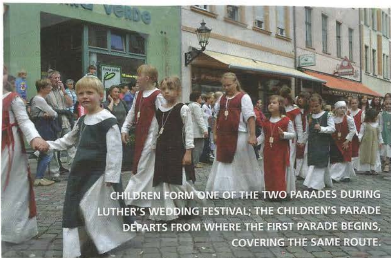
CHILDREN FORM ONE OF THE TWO PARADES DURING LUTHER'S WEDDING FESTIVAL; THE CHILDREN'S PARADE DEPARTS FROM WHERE THE FIRST PARADE BEGINS, COVERING THE SAME ROUTE.

Other artisans teach children to emboss leather bags that they can take home with them, while others demonstrate the use of spinning wheels, and even others instruct festival-goers in the fine art of using a bow and arrow.