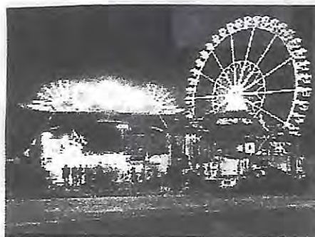
Entrance of Hamburger Dom at night

It is no longer a “genuine” traditional Christmas market – the Hamburg “Dom”, which got its name from the former medieval Christmas market held at the St.-Marien-Dom, an 11th century cathedral that had to be pulled down in 1806 due to its dilapidated state. Today the Hamburg Dom is held on the fairgrounds of the Heiligengeistfeld from the beginning of November to the beginning of December. This date already indicates that the Dom isn't a Christmas market in the actual sense of the word anymore. On the contrary, today it is a big-city fair with all sorts of typical fairground attractions like merry-go-rounds, roller coasters, Ferris wheels, bumper cars and the like.