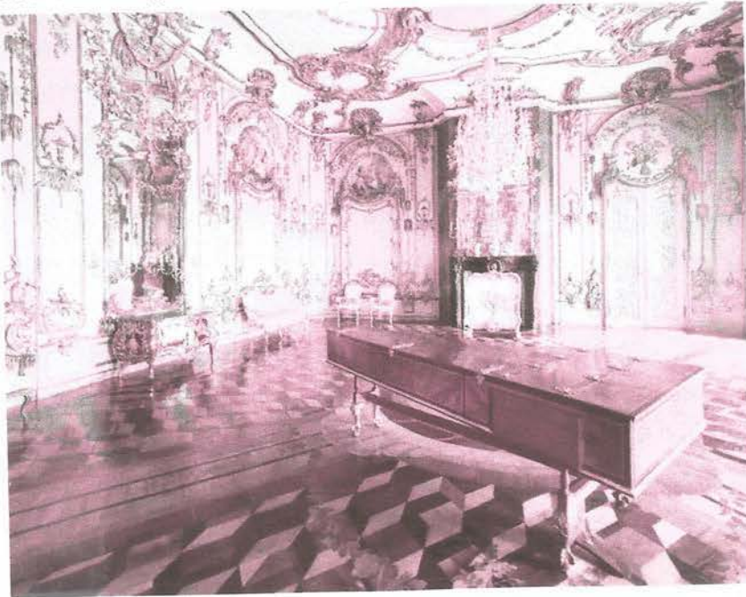
Christmas fragrances of evergreens, burned almonds and sugar-glazed fruit will welcome you in the city of Potsdam. Christmas time turns this small town into a mecca for Christmas market lovers from all over Europe! The palace Sanssouci (pictured above) is also a good side trip in between craft stands.