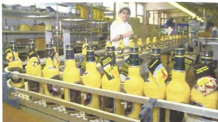
Eierlikör: Not to be confused with eggnog! Germans toss back this strong liqueur regularly to get into the festive Christmas market mood.