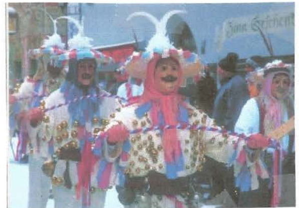
Carnival in Bavaria München-Oberbayern

The highlight is the Sunday parade of the Damischen Ritter (Daft Knights). This Faschingsumzug is lead by Duke Kasimir and his retinue of knights, clowns, colorful floats and marching bands. It takes place along Herzog-Wilhelm-Straße with a spectacular after party at Hofbräuhaus around 2:30 p.m.