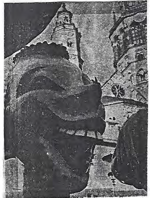
Rosenmontag in Mainz.

(Mainz) . . . The Mainz variety, called Fassenacht , is considered by many to be the most distinguished in Germany. Especially renowned is the quality of the carnival Sitzungen . . . All in all, their carnival seems to be more genuetlich than in other cities; there is an atmosphere of genuine, friendly merriness (sic) all over the place.