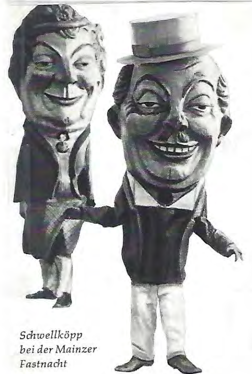
Schwellköpp bei der Mainzer Fastnacht