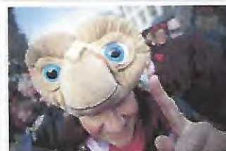
A woman dressed as E.T. at the Mainz Carnival