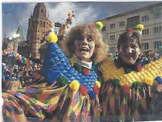
Send in the clowns: Carnival in Mainz.