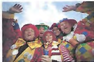
A group of clowns gets into the carnival spirit in Mainz