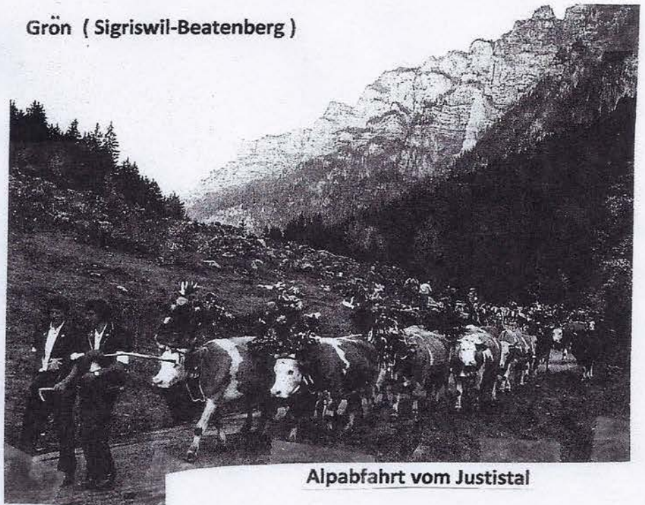
Alpabfahrt vom Justistal