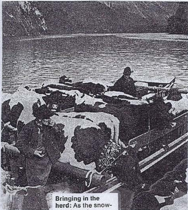
Bringing in the herd: As the snow-clouds gather, Alpine farmers are bringing down their cattle from the mountain pastures to their winter stalls. In the Königsee area, many cows have to be transported in broad flat-bottomed boats to the other shore. To while away the time, one farmer enjoys a pinch of snuff