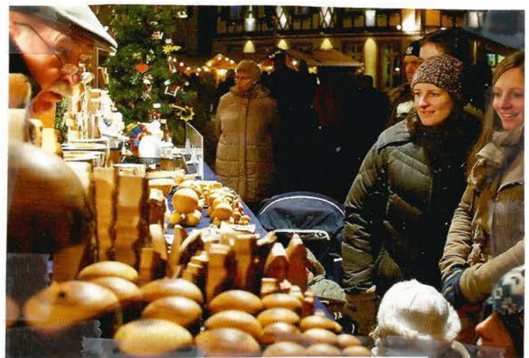
CHRISTMAS MARKET STALLS ARE FILLED WITH QUALITY GOODS.