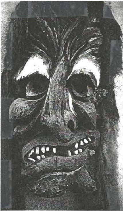
Many participants in the Carnival tradition wear masks handed down through their family while others wear masks purchased from local artisans.