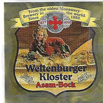
THE LABEL OF WELTENBURG’S ASAM BOCK FEATURES A LIKENESS OF COSMAS ASAM, ONE OF THE FAMED ARCHITECTS WHO CREATED THE CHURCH OF ST. GEORGE.

Weltenburg produces 12 distinct beers, and their quality is reflected in over 40 gold medals from some of the most prestigious beer competitions in the world. Perhaps their most famous brew is the “Barock Dunkel,” three-time winner of the Best Dark Beer at the World Beer Cup awards. Full-bodied, with an intense malty aroma and a creamy,