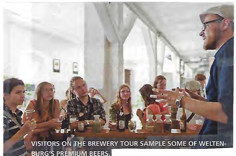
VISITORS ON THE BREWERY TOUR SAMPLE SOME OF WELTENBURG’S PREMIUM BEERS.